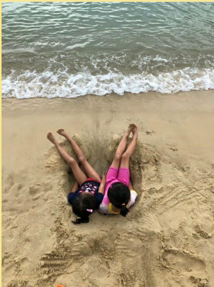
(This photo of me and my sister was taken by my Dad. Photo taken before the implementation of Covid-19 safety measures)

“What’s stopping you from getting out of the house and enjoying some fresh air?”