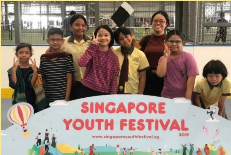
Photo taken before the implementation of COVID-19 safety measures