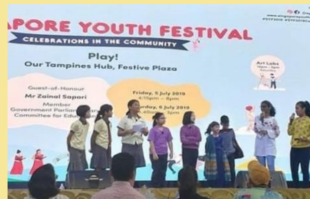
Photo taken before the implementation of COVID-19 safety measures

I am so glad I experienced performing in front of strangers. It boosted my confidence. Although I am disappointed that there was no SYF this year, I am looking forward to more opportunities to perform and I have signed up for the upcoming Readers' Theatre.