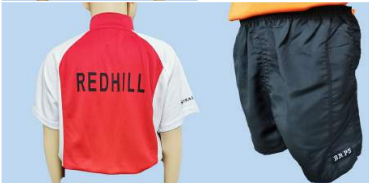
PE T-SHIRTS AND SHORTS