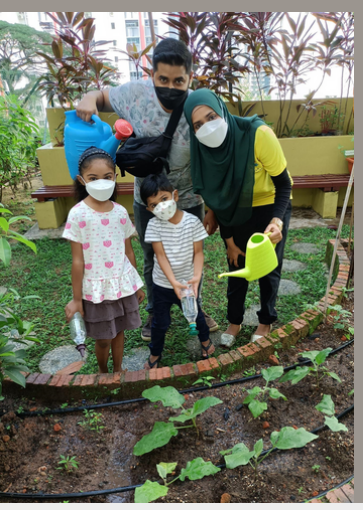
Parents and child gardening session in June