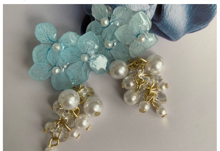
Pressed flower earring creation by Fang Fang