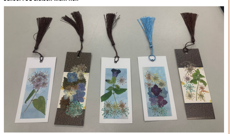
Pressed flower bookmarks made by us!