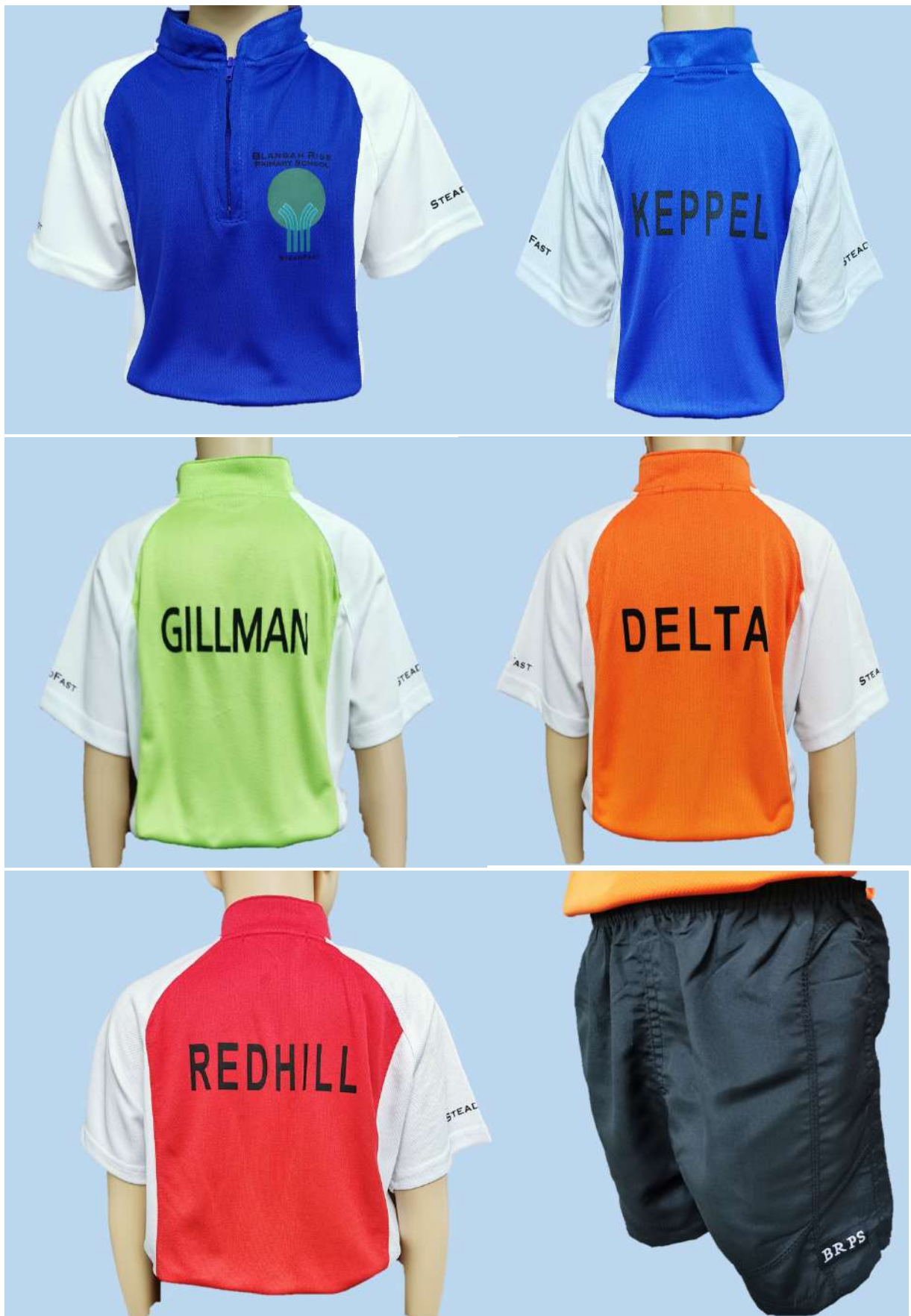
PE T-SHIRTS AND SHORTS